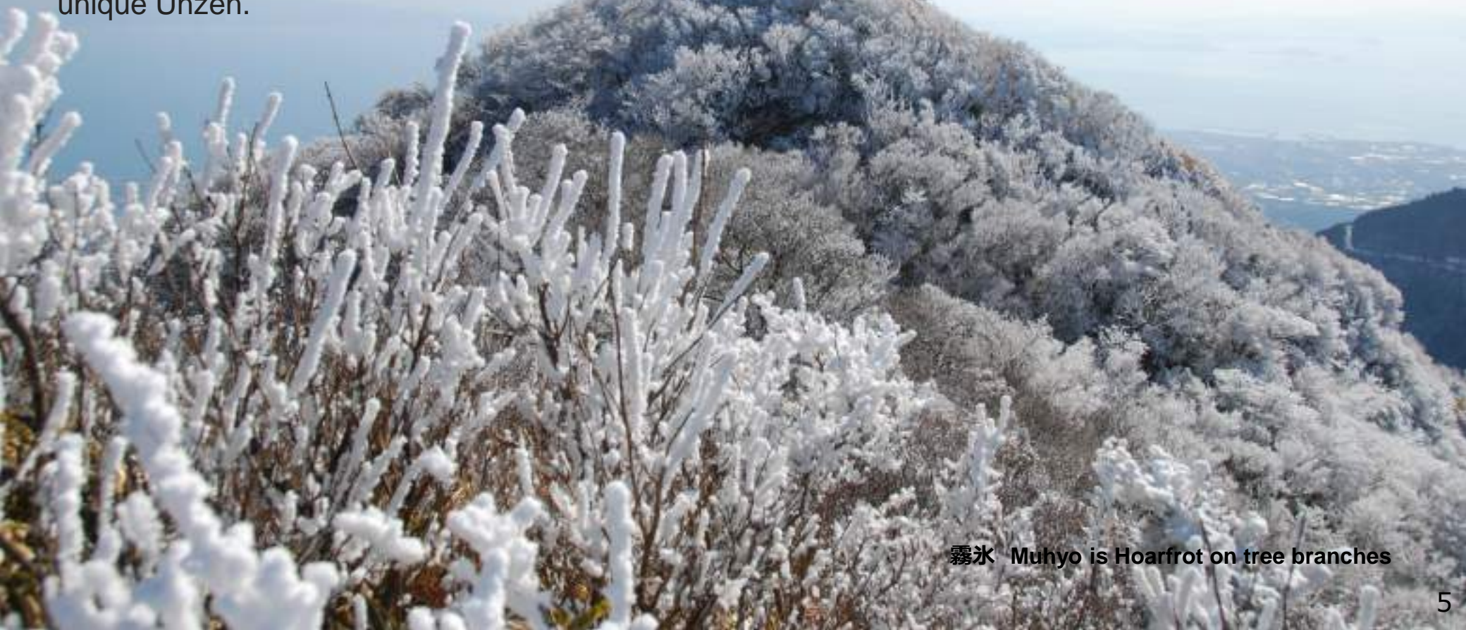
霧氷 Muhyo is Hoarfrot on tree branches

At the heart of Unzen lies a place that has long been a place of worship, a place that brings blessings, and a place where people can live together. It is a living volcano. Hot springs allow you to experience the workings of the earth, mountain climbing allows you to encounter diverse life, and the bounty of the land and sea brought by the volcano. Unzen is a treasure trove of nature designated as Japan's first national park and a Global Geopark. We will introduce its charms from various angles and guide you to your own unique Unzen.