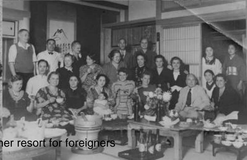
About 100 years ago Summer resort for foreigners