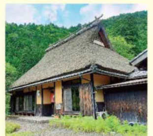
Matabe thatched B&B

There are more than 30 accommodations in Miyama, including inns, guest-houses, and private lodgings. Among them, the thatched roof inns are especially recommended. Enjoy your stay while feeling the atmosphere of Japan.