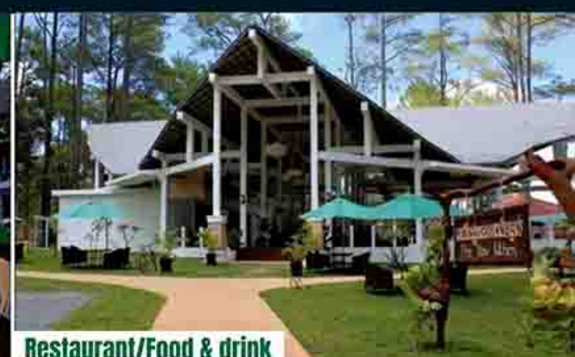
Restaurant/Food & drink