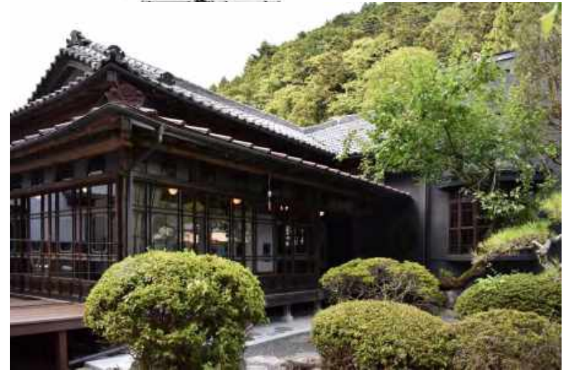
Outlook from garden