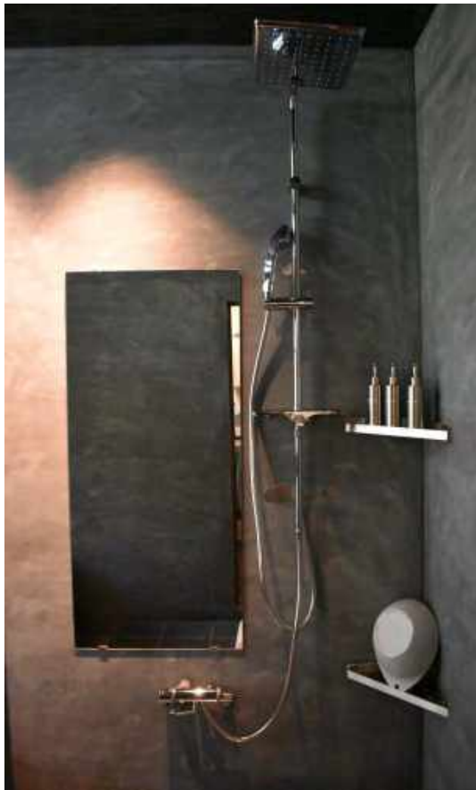
Rain Shower In Onsen Bath