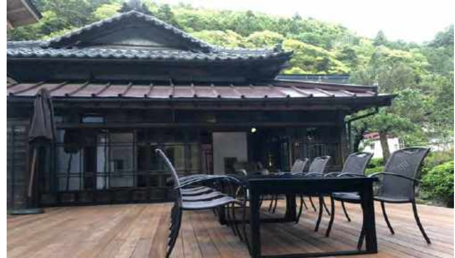
Can Be Utilized As Dining