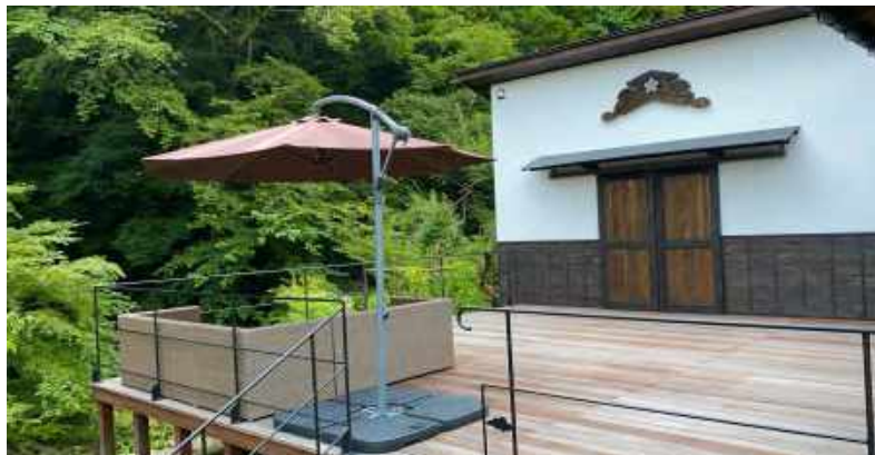
Nice Place For Coffee, Reading, Chatting, And Relaxing