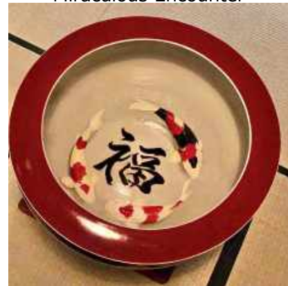
Painting on the bottom pottery "Come Fortune"