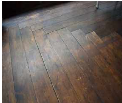
“Ajiro” Form Joints Of Floor Panels