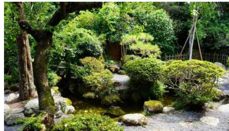
Traditional "Heart" character shaped pond