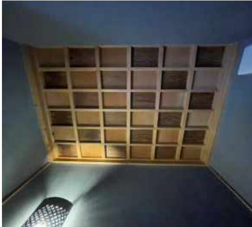
Traditional Checker Pattern Ceiling In Washroom