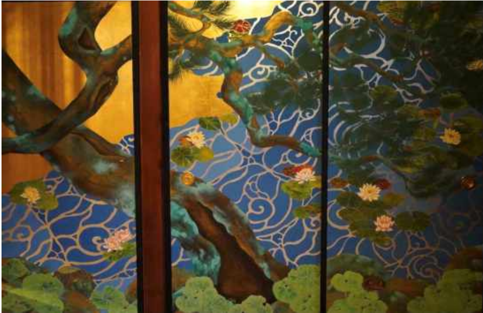
Slide door painting by Buddhism art painter