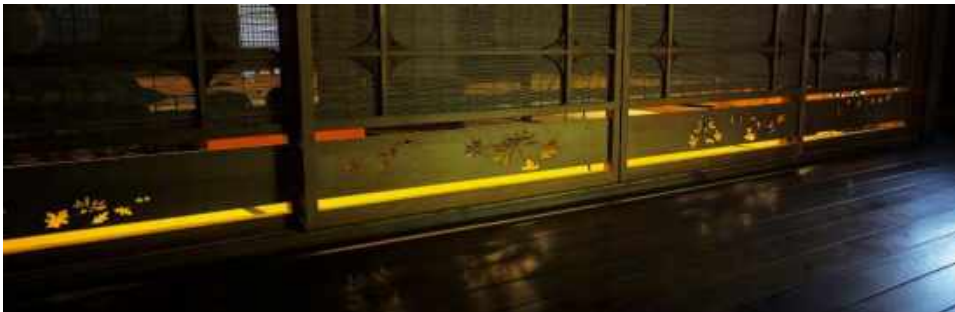
Finely decorated reed sliding door