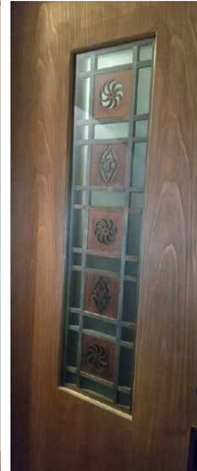
Sweets Molds On Sliding Door Window