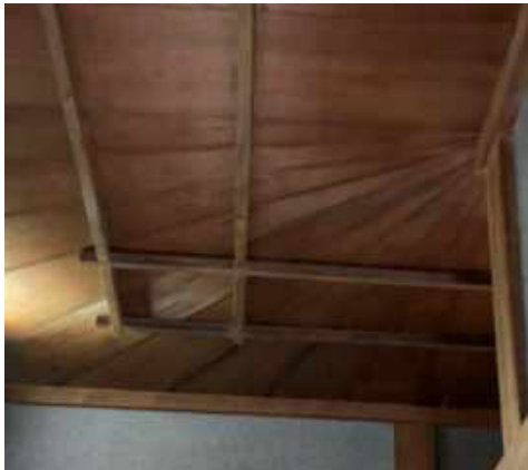
Radiating Form Ceiling Panels