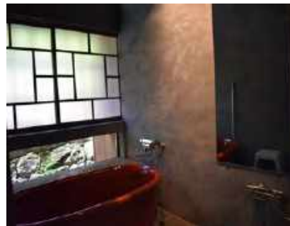
"Shigaraki" Pottery Bathtub