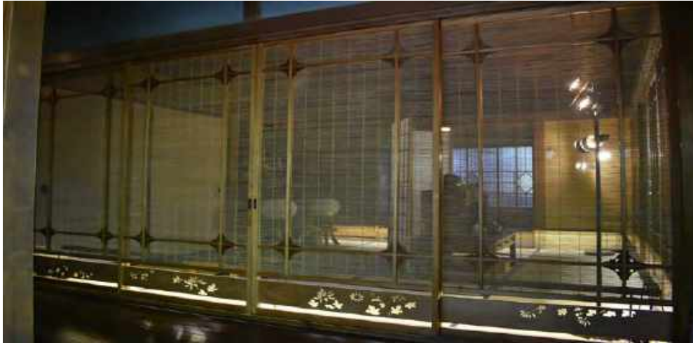
Buddhism Alter Room