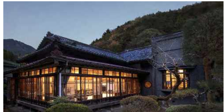
Night View Of The Villa From The Garden