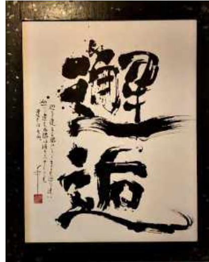
Calligraphy by local artist "Miraculous Encounter"