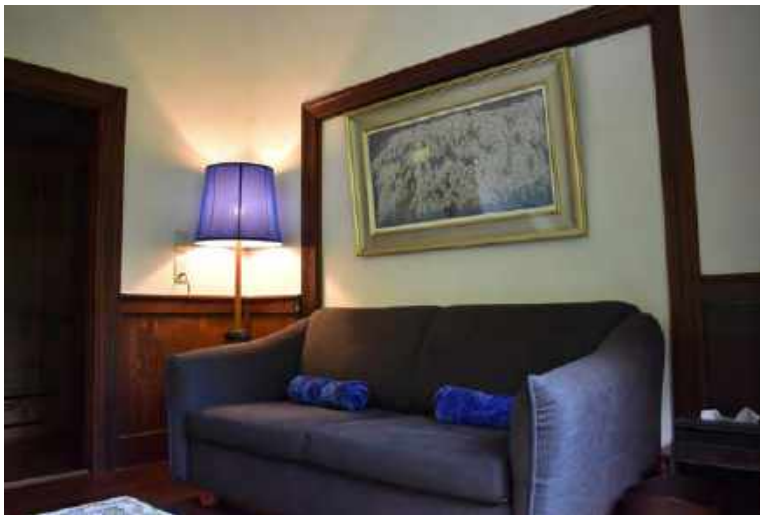
Sofa bed in western style room