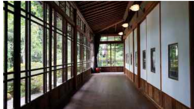
Original Early 20 th Century Glass Windows And Cloud Shaped Lighting Shades