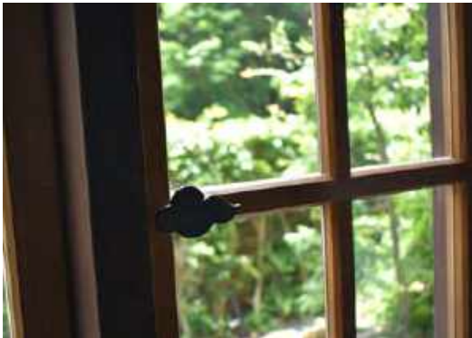
Cloud Motif Window Knob