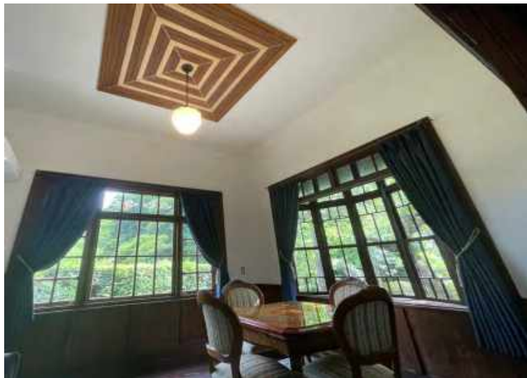
High ceiling western style room – mode of the aera