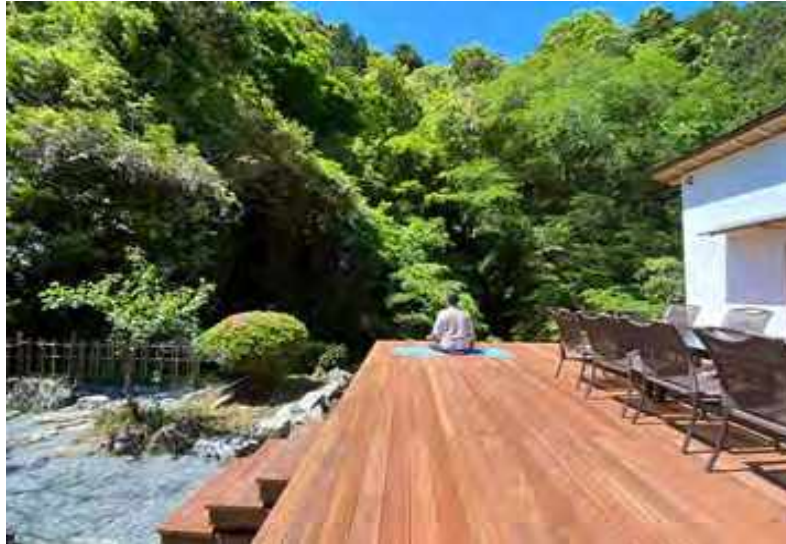
Perfect Place For Yoga Practice