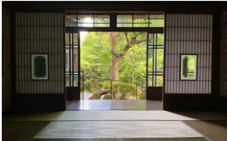
Garden view from living room