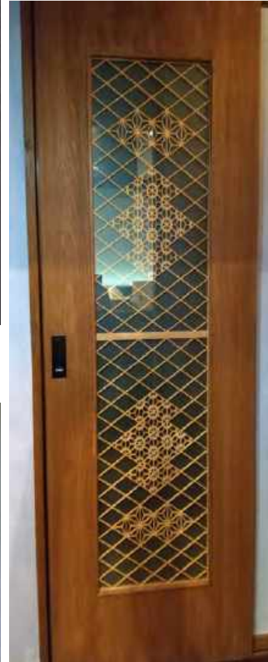
Wooden Muntin On Sliding Door Window