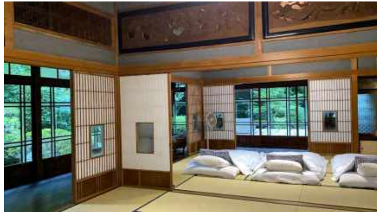
Japanese style bedroom