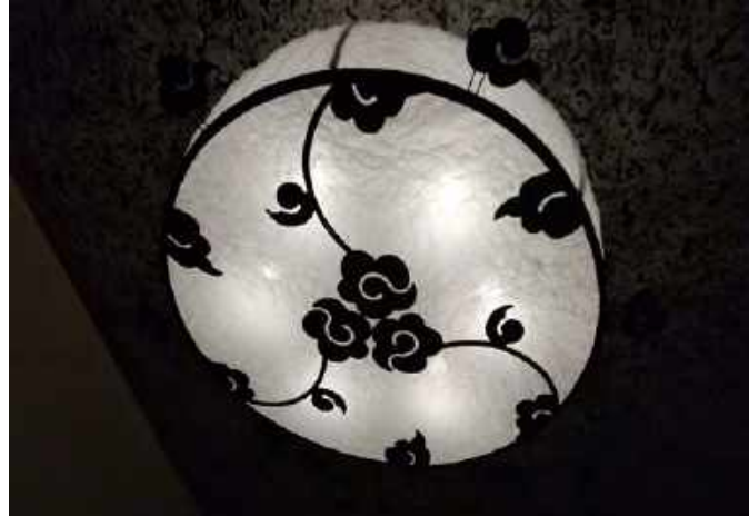
Cloud Motif Lighting Share In Dining Room