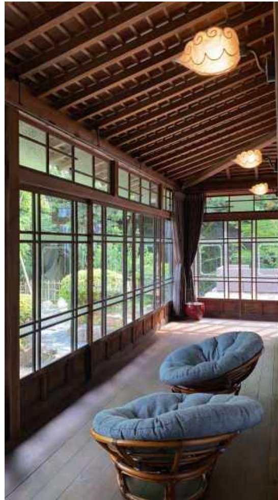
Corridor with garden view