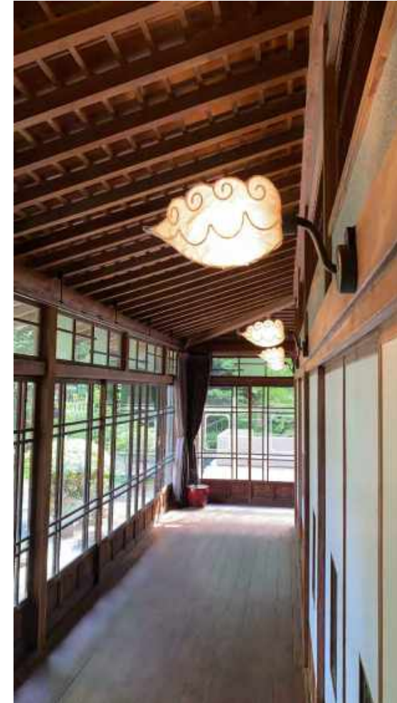
Cloud shape lighting shades local artist