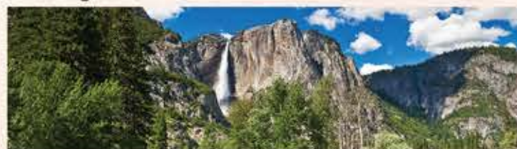
Yosemite Falls in Spring

Warm days and cool nights make autumn a favorite season. Daytime temperatures and beautiful fall foliage, make this the perfect season for hiking and photography. The cool evenings invite outdoor dining and stargazing beside a toasty campfire. This time of the year means fewer visitors and many of the same activities of summer, including rock climbing, hiking, and biking, without the summer heat and traffic.