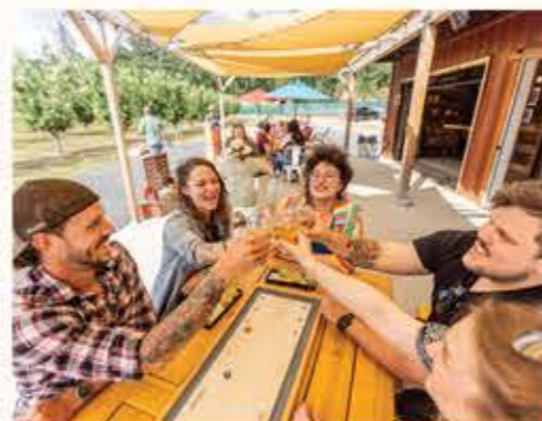
Sierra Cider's tasting room includes views of the apple orchard and fun bar games.

Arrive in Mariposa and explore the three incredible museums (Mariposa County Museum & History Center, Yosemite Climbing Museum, and California State Mining & Mineral Museum) that give the town one of the best small-town culture scenes in the United States. Take an unforgettable leap over Yosemite National Park with Skydive Yosemite or a scenic air tour.