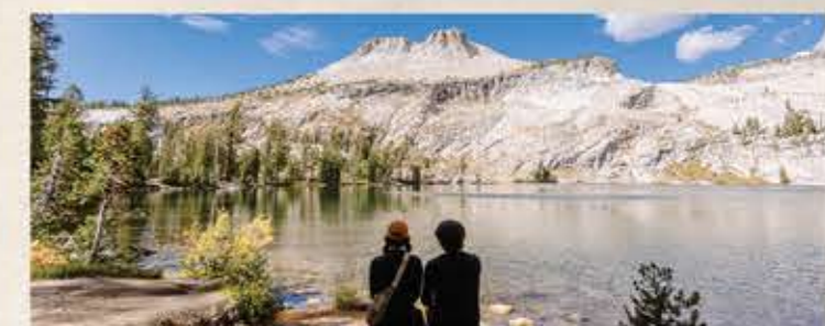
Take a summer hike to May Lake in the High Sierra.

One of the best ways to immerse yourself in Yosemite Mariposa County is on a guided tour. Let someone else do the