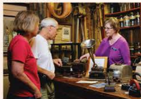
Mariposa County Museum and History Center is full of great artifacts from the Gold Rush and local Native American culture.

Other alternative historic towns include Coulterville, Fish Camp and Buck Meadows.