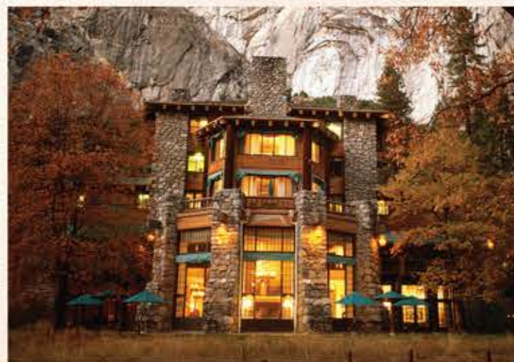
The Ahwahnee is known for its history, elegance and hospitality.

When people think of Yosemite, they often think of camping. With its one-of-a-kind natural splendor, there's no better place to sit back and count the infinite Sierra Nevada stars. While camping inside Yosemite National Park is popular, reservations can be difficult. The solution? Camping options outside the park in beautiful Mariposa County, where campsites are abundant and much easier to secure.