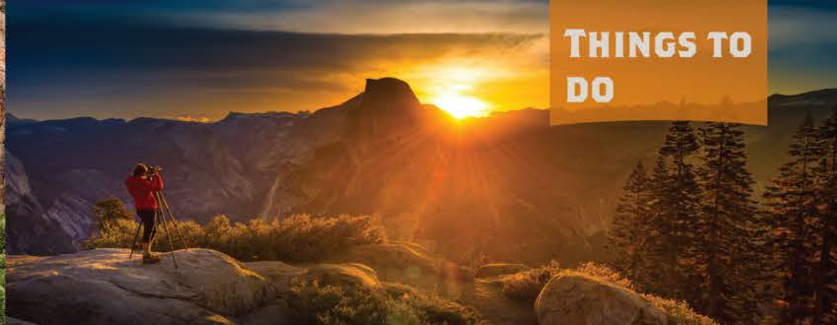
Tunnel View is always awe-inspiring.