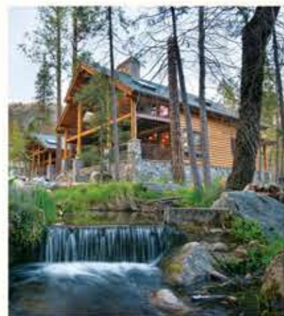
From cozy cabins to luxury homes, the Redwoods in Yosemite offers vacation rentals inside the park gates.

Yosemite Mariposa County boasts hotels & motels to suit every itinerary and budget. Yosemite National Park stays such as The Ahwahnee, waterfall-adjacent Yosemite Valley Lodge and historic Wawona Hotel offer up-close-and-personal nature access. Nearby Cold Country gems such as the boutique River Rock Inn and the charming Mariposa Hotel offer lodging steeped in Mariposa County history. The Four Diamond resort Tenaya at Yosemite provides exceptional year-round lodging and activities.