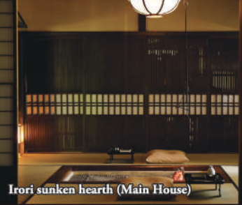
Irori sunken hearth (Main House)