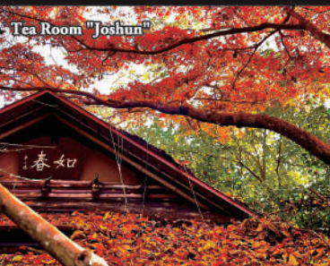
Tea Room "Joshun"