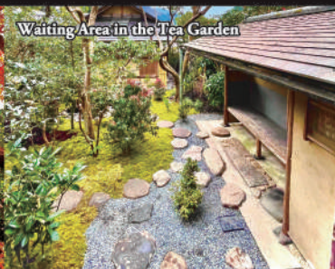
Waiting Area in the Tea Garden