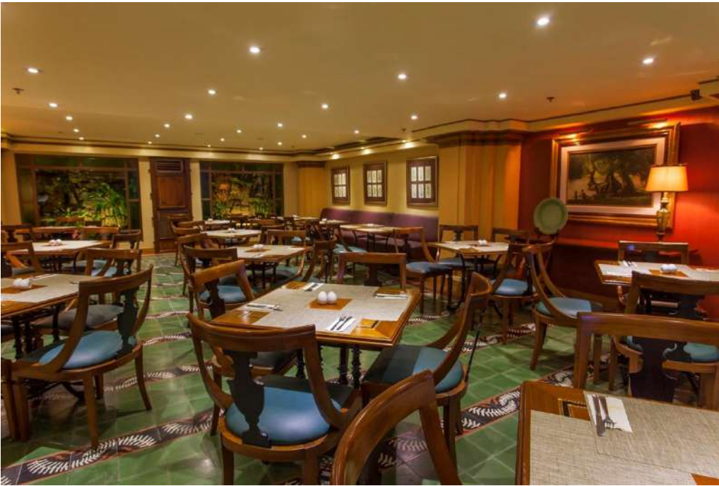
Coca Cafe in Herald Suites

While each guest is receptive to a complimentary breakfast, the hotel houses three restaurants where they can take delight in their personal preferences: Casual relaxed atmosphere or ambience Coca Cafe , cozy nook Meridian Lounge , and Japanese restaurant Hatsu Hana-Tei .