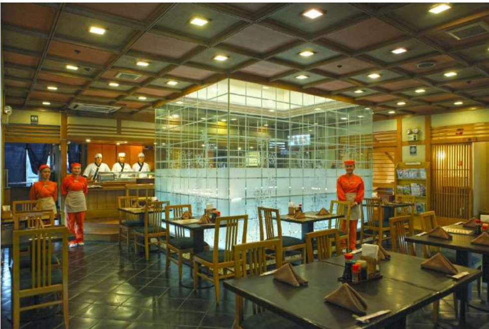
Hatsu Hana Tei